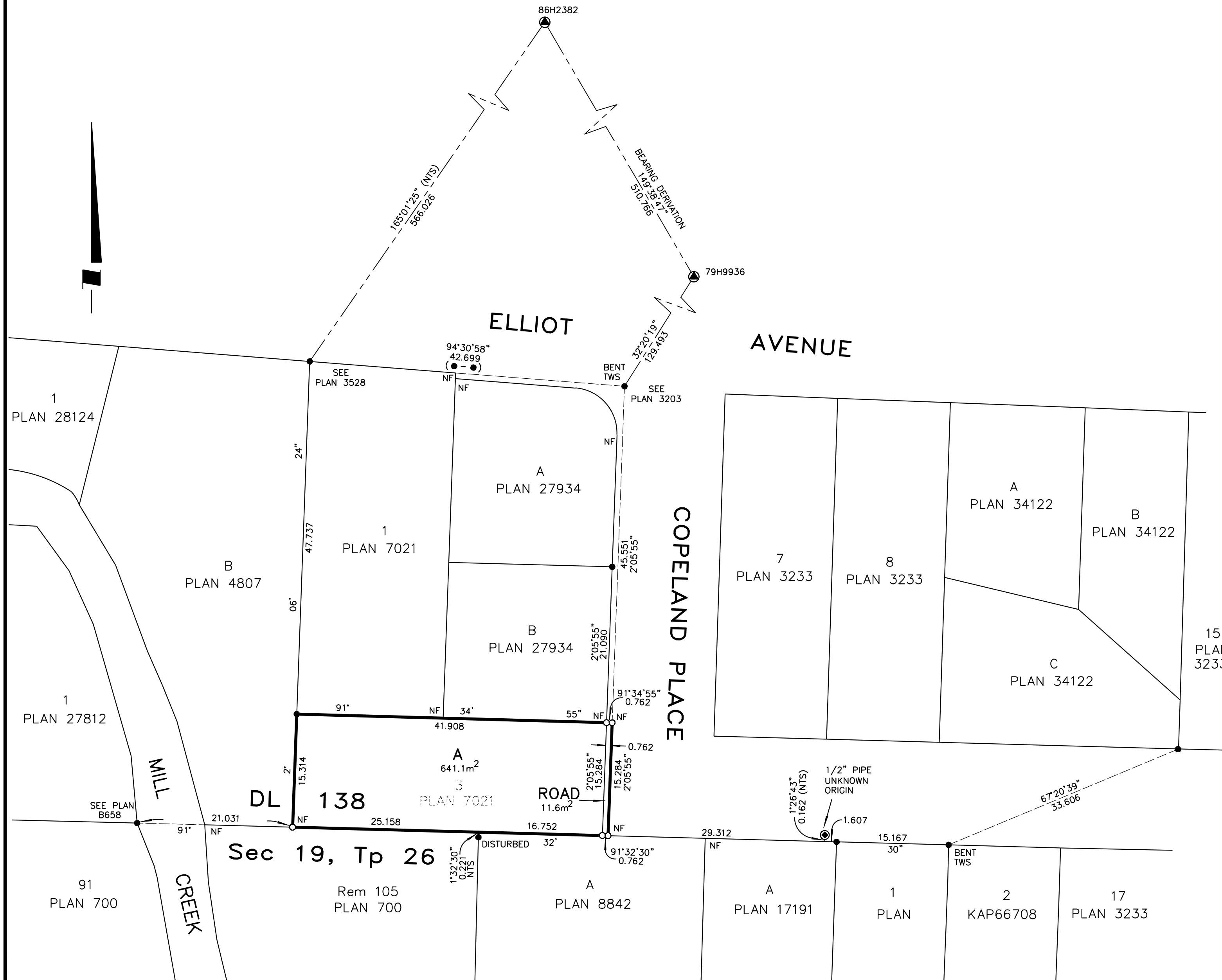
TABLE OF GEODETIC CONTROL MONUMENTS